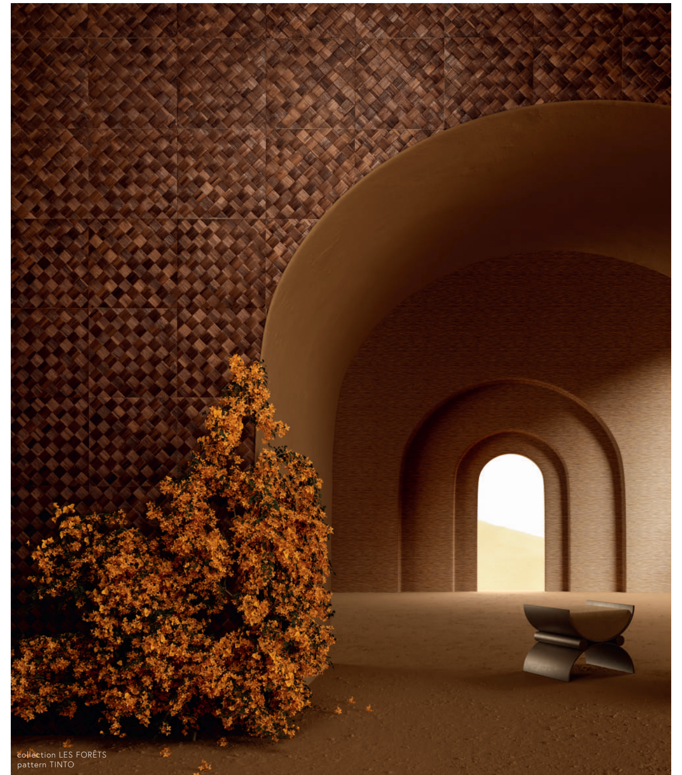
collection LES FORÊTS pattern TINTO